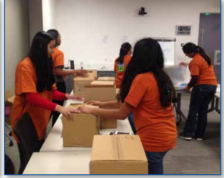
Dougherty High School Pink Dot Club hosts a packing party to send Donate Life materials to DMVs